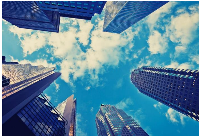
Urbanization drives population density and air traffic demand

Safety is a major concern for all airports, both off and on the ground. By using AirLim, your airport ensures and documents the safety compliance of approach and departure paths as well as surrounding areas for air traffic circulation with respect to obstacle limitation surfaces.