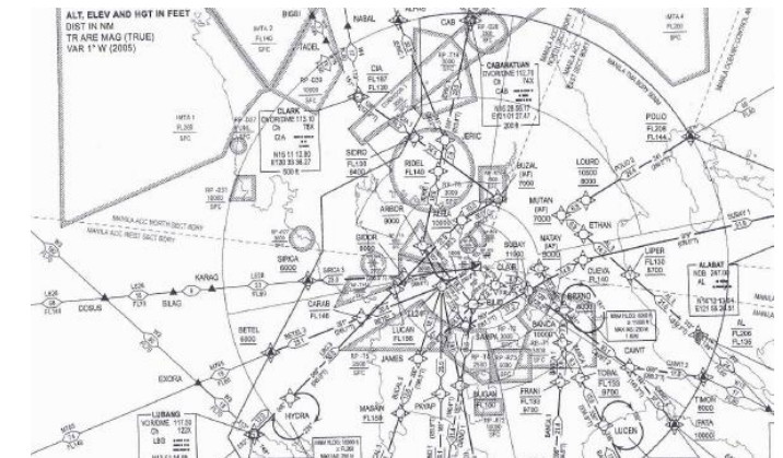
Arrival and departure procedures that must consider obstacles.