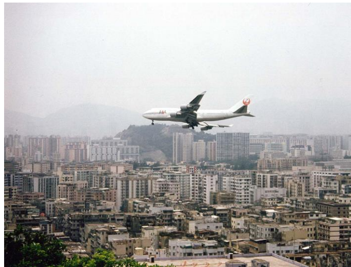
Transportation hubs and population centers are intradependent