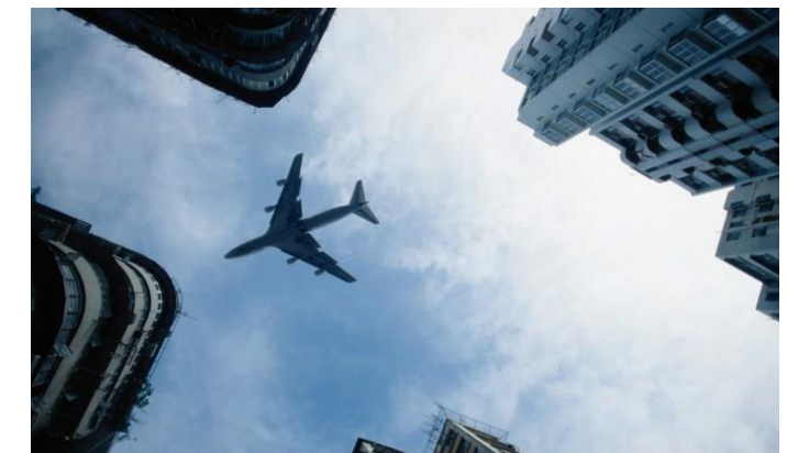
Flying safely to and from your airport.

Our AirLim produced obstacle surface assessments have already proven their worth in airports in several different regions including Europe, Asia and the Middle East.